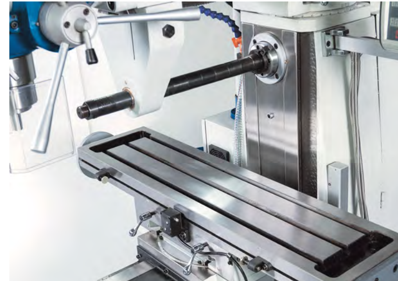
Solid top beam with outer arbor allows rigid mounting of long milling arbors