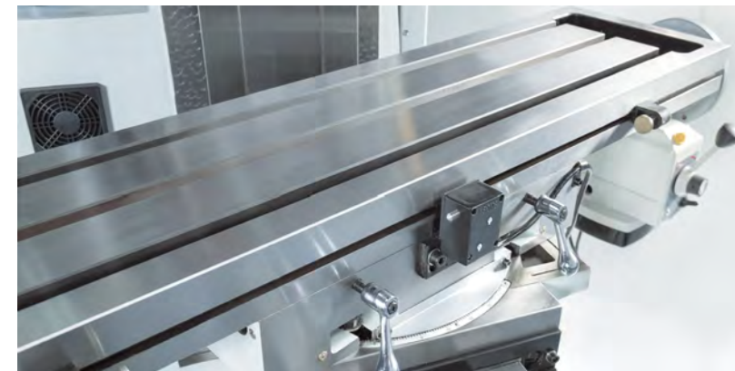
Machine table swivels in X-axis