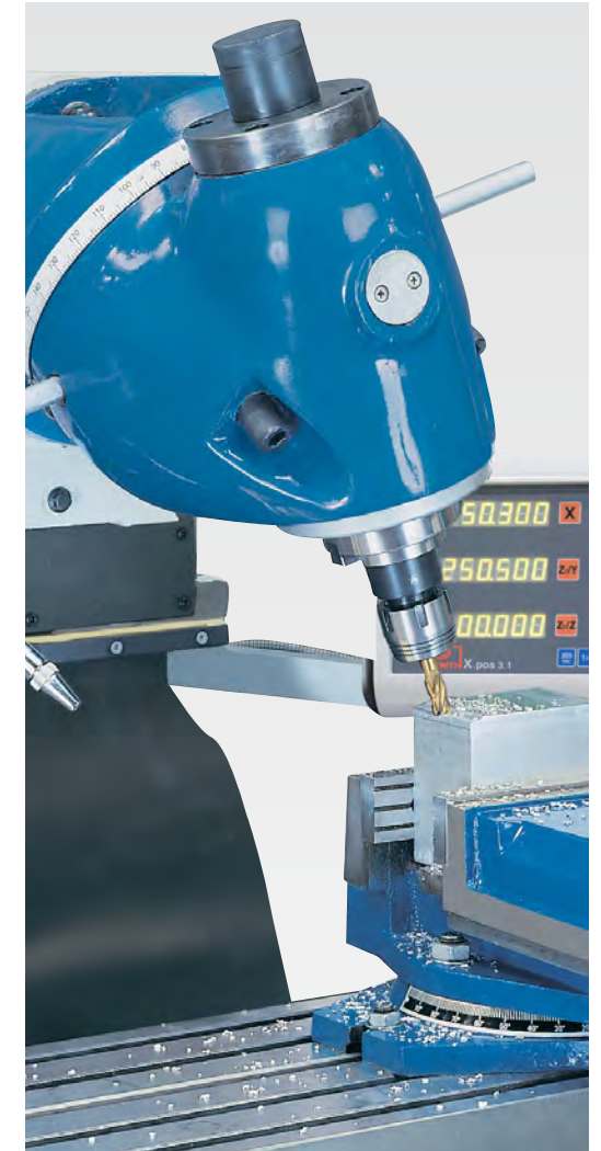
Cutter head swivels on 2 levels