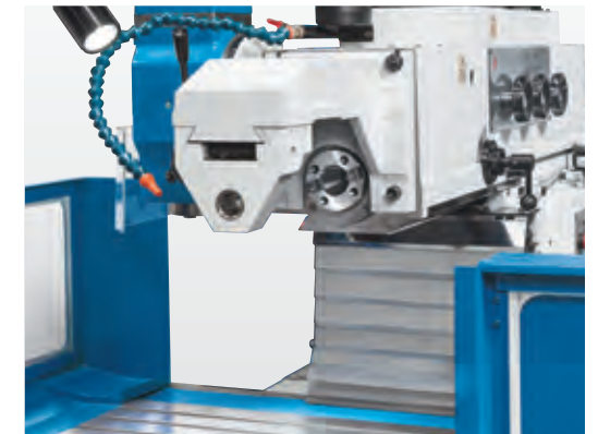
The FPK 6 features an outer arbor support for long milling arbors