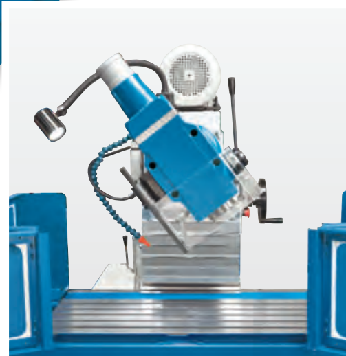
Angle-adjustable vertical cutter head with sliding quill