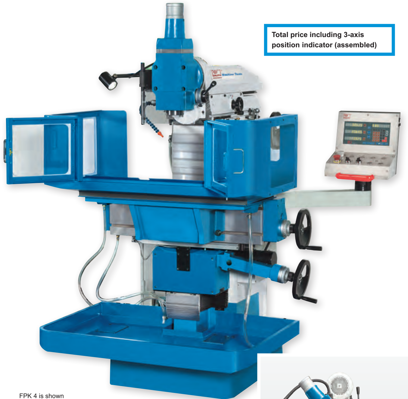
FPK 4 is shown

Total price including 3-axis position indicator (assembled)