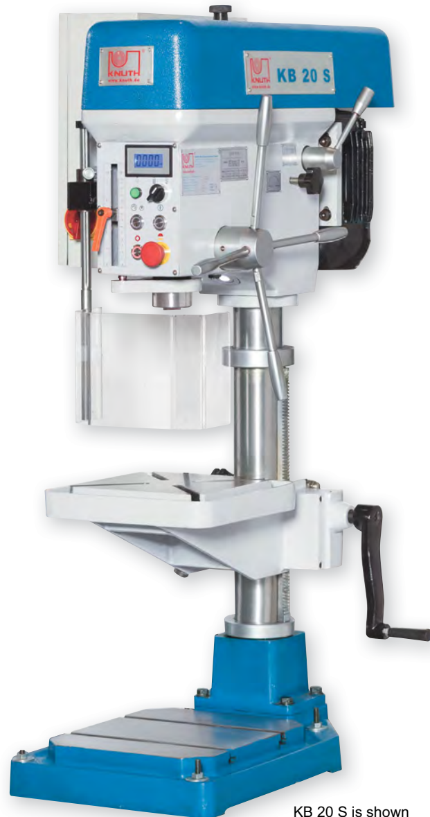
KB 20 S is shown