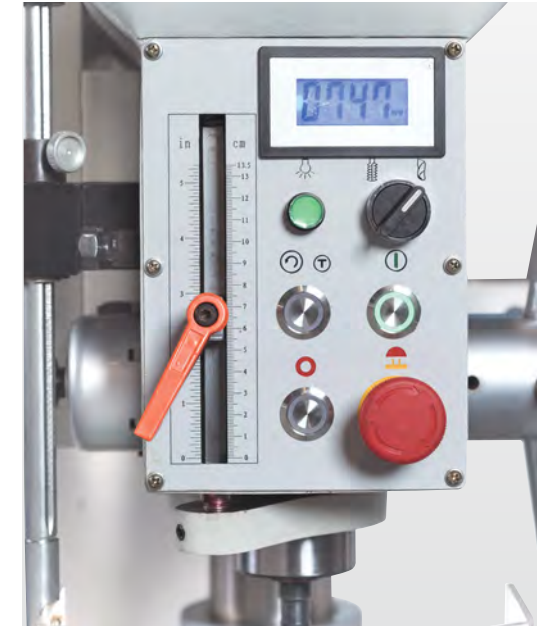
Digital rpm display and rigid depth stop

For this machine, visit our website and search for KB 20 S or KB 32 SF (Product Search)