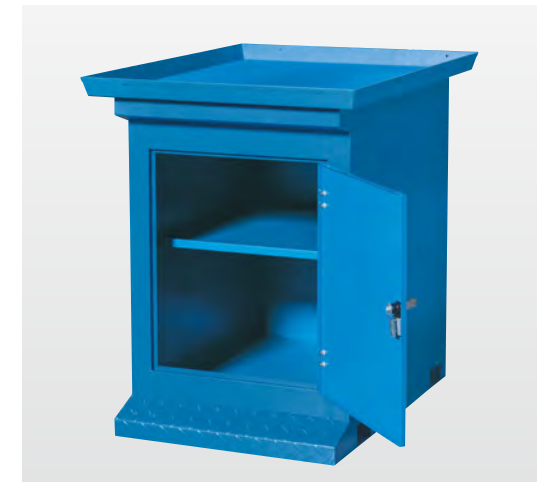
Universal machine base with storage room for the KB 20 S Part No. 123952