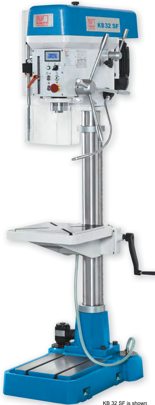
KB 32 SF is shown